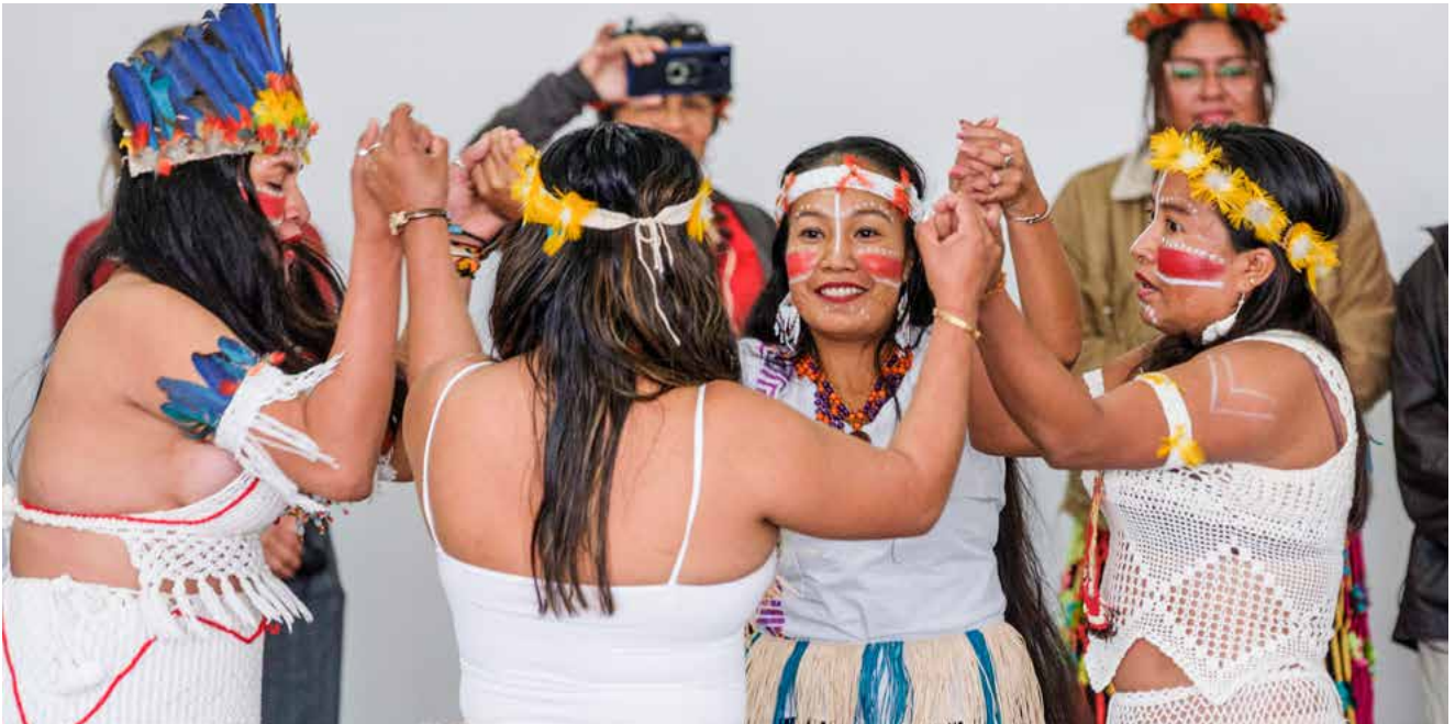
Start-of-day ritual led by Guyana fellows.

The fellows from Guyana led the start of the day, and in their ritual, they expressed gratitude for the strength of Indigenous women who are fighting for the conservation of their territories. After this energizing ceremony, we began with the learning sessions: