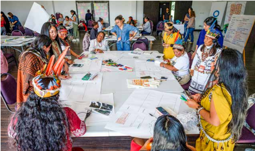
Dream maps session.

To understand the projects of women related to management plans, to comprehend how these plans have helped promote the conservation of territories and why they are important.