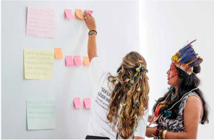
Construction of concept maps in the Reforestation and Restoration session.