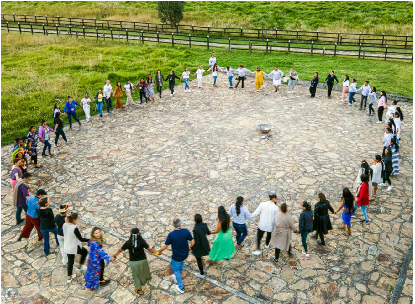
Closing circle of the meeting.

The Second Meeting of Indigenous Women of the Amazon has been one of the main milestones of the Program in 2023. On the one hand, it allowed us to learn about the results, challenges, and best practices of the projects of some of the fellows from the second generation. On the other hand, it enabled the fellows participating in the third generation to leverage these experiences to enhance the implementation of their projects in the initial stage.