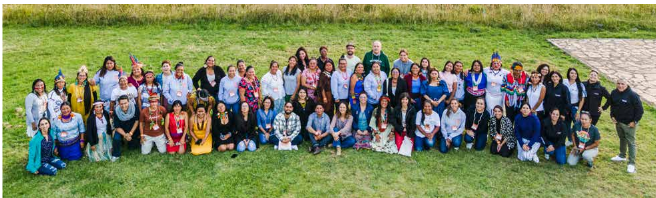
Participants of the Second meeting of Indigenous Women of the Amazon.