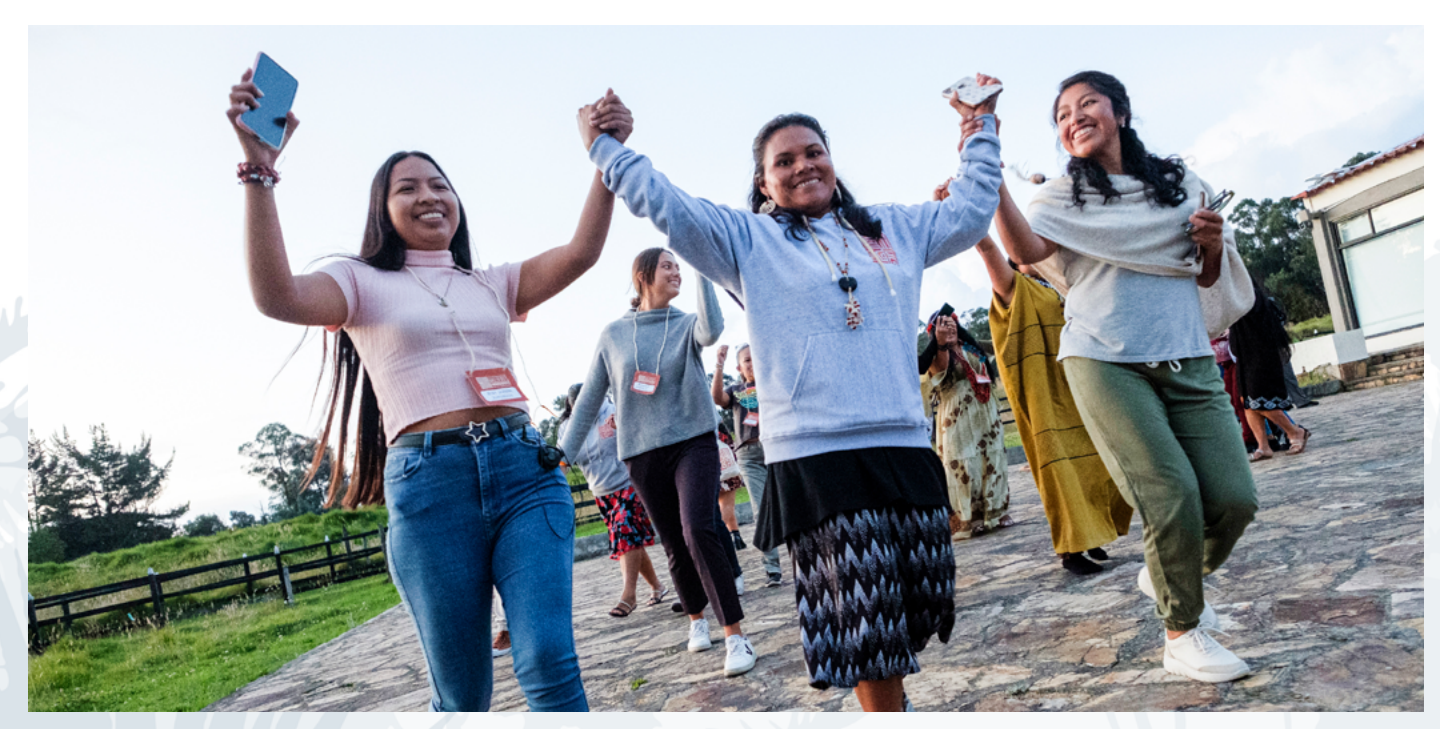
Image 1. Second meeting of Indigenous Women of the Amazon.