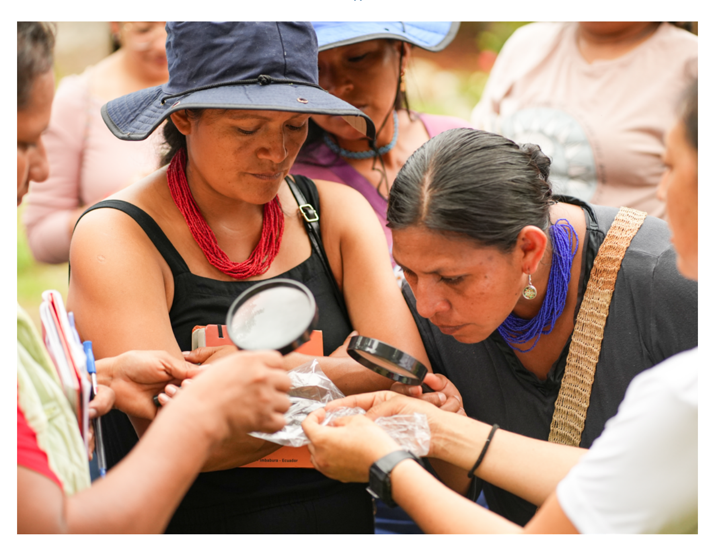
Image 7. Indigenous women from Bolivia, Ecuador and Colombia gathered to learn and share experiences in working with Amazonian Melipona bees.

"Conserving bees in their native environment. This is what I have learned, and I have given workshops to the women of my community, with the young people, and with the children about the importance of conserving the melipona bees that are found around our community".