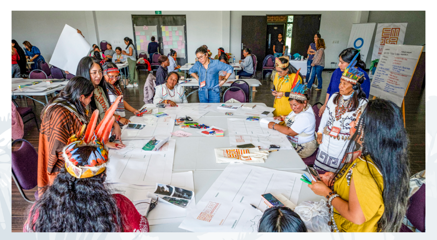
Image 8. Dream maps session at the Second meeting of Indigenous Women of the Amazon.

To consolidate an Amazon Indigenous women network, we are gathering lessons to continue connecting fellows across generations. Next year we will be implementing our networking strategy that aims to involve alumni fellows as mentors, facilitators, experts, and advisors. We also plan to improve the communications channels among fellows to promote collaboration and information sharing.