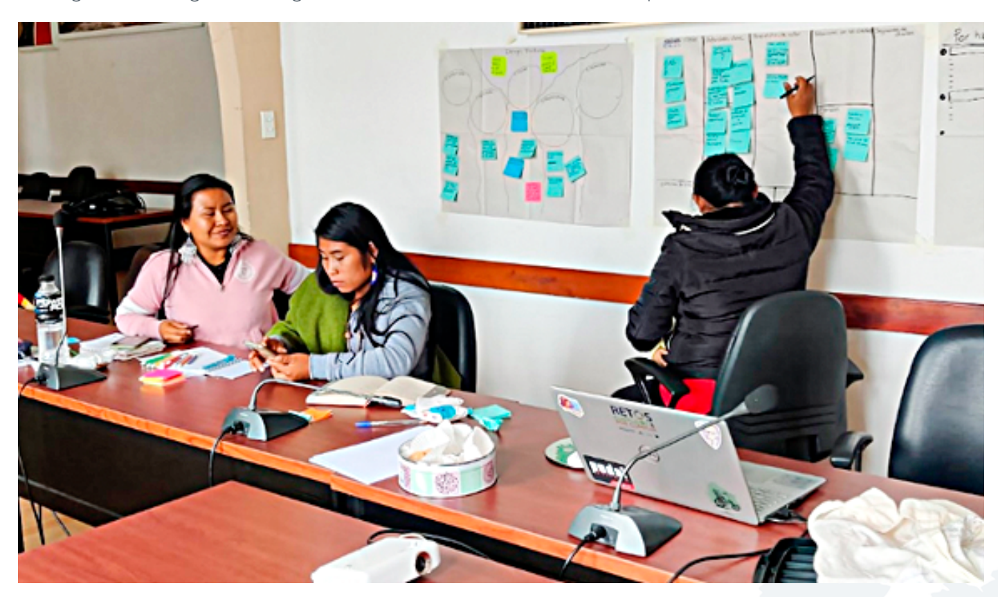
Image 6. In-person project management workshop in Quito, Ecuador.

This year training topics included: Indigenous peoples' rights, women's rights, project and financial management, Indigenous negotiations, self-esteem, and leadership.